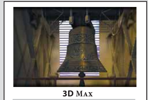
Environment Modeling 3D Max & Photoshop Texture Camera and Bell Animation UV Mapping. Multi Pass Render