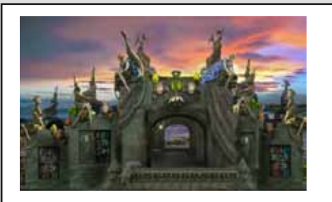
Photoshop, After Effects