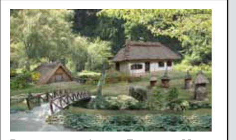
Photoshop, After Effects, Nuke