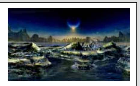
Matte Painting Multi Pass Compositing, Combined with Cloud & CG Smoke Footages, Rotoscoping, Blue Screen Removal (birds)